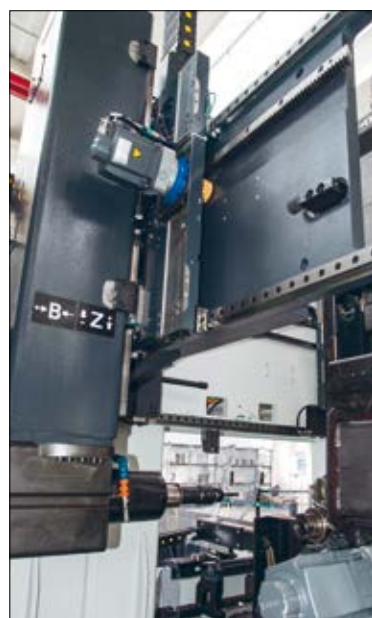
Auxiliary axes with 300 mm stroke