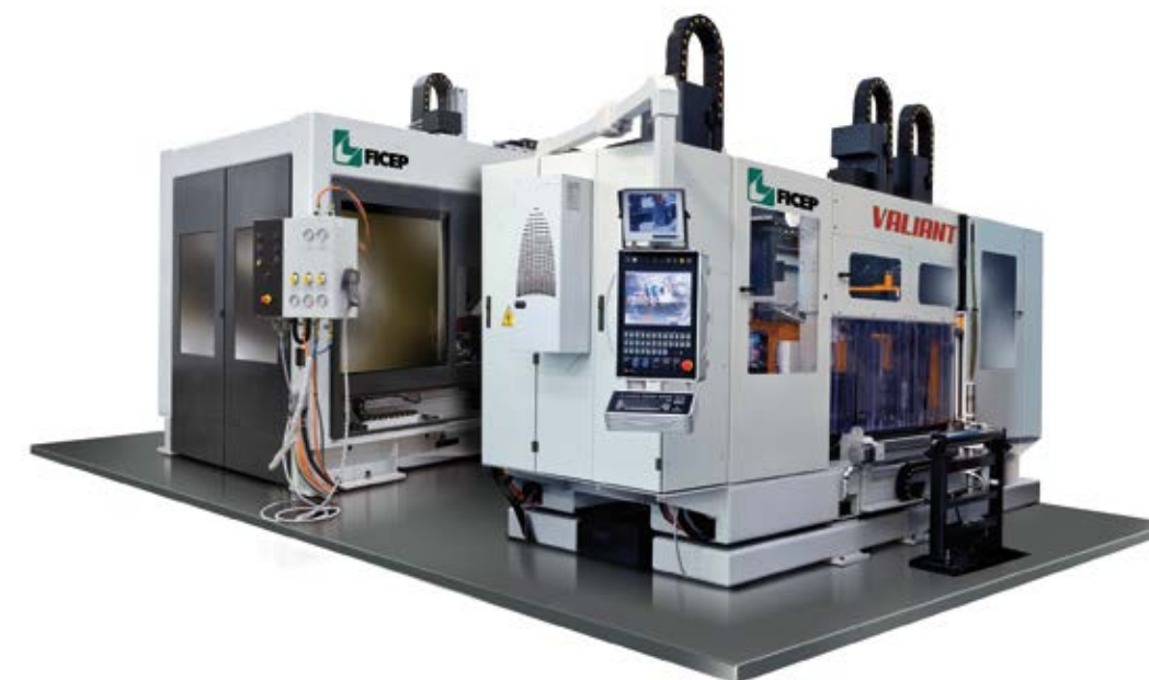
Valiant drilling line combined with coping robot