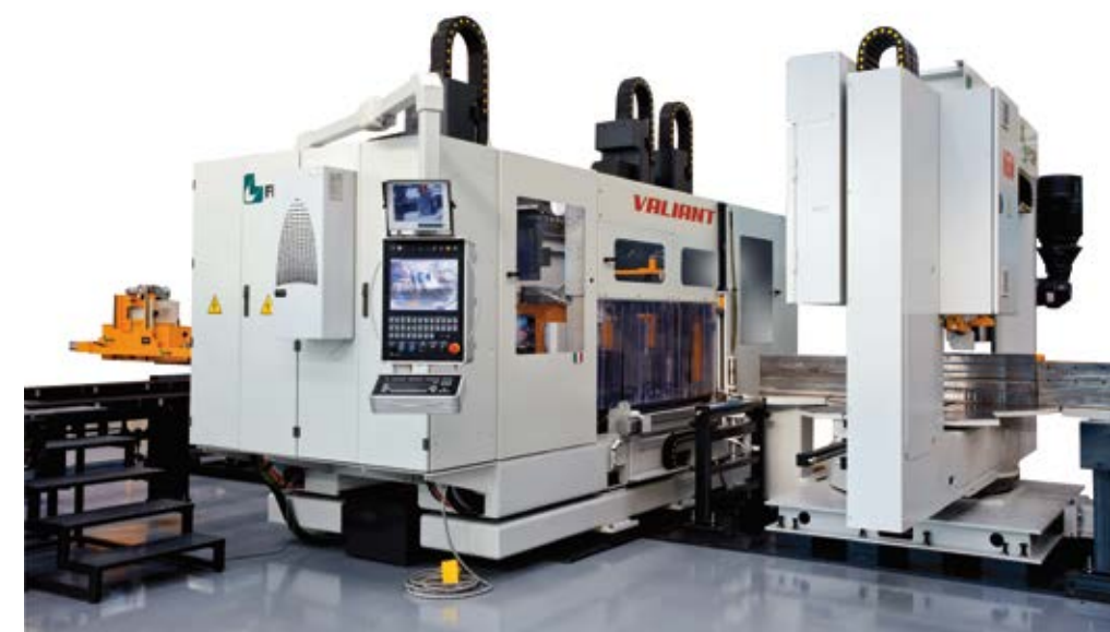
Valiant drilling line combined with band saw

The Valiant can easily be combined with the range of our band saws and coping robots to create an extremely productive integrated work cell, which is all managed by the same CNC control and software. This permits such typical task as straight or mitered cuts with a band saw or the plasma/oxy-fuel cutting of copes, mechanical openings, flange thinning, rat holes, weld prep, beam splitting and more.