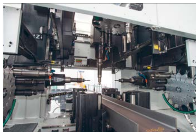
14 positions tool-changer